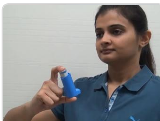
Step3: Shake the inhaler well for 5 seconds.