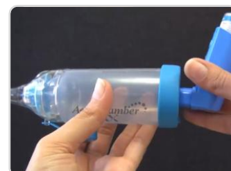
Step4: Insert the inhaler into the open end of the chamber. Ensure that the inhaler fits properly.