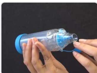
Step2: Remove the cap from the spacer.