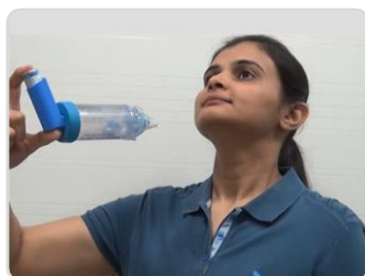
Step6: Tilt your head back slightly.