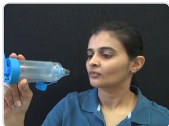
Step9: Hold your breath for 10 seconds. Exhale slowly through your mouth or nose.