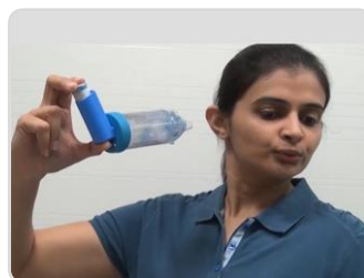
Step7: Exhale away from the inhaler.