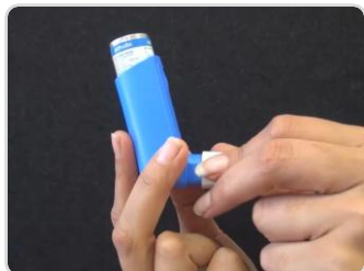
Step1: Remove the cap from the inhaler.