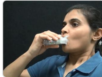
Step7: Keep Respimat in your mouth. Start taking a slow and deep breath. And press the "dose dispensing" button, at the same time.