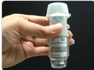
Step2: Turn the transparent base in the direction of the arrow. You'll hear a click.