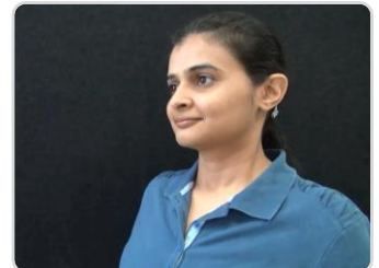
Step4: Sit straight or stand up.