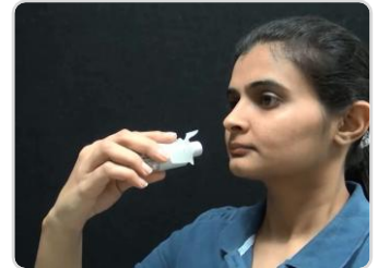
Step8: Hold your breath for 10 seconds. Exhale slowly through your mouth or nose.