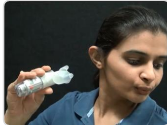
Step6: Exhale away from the inhaler.