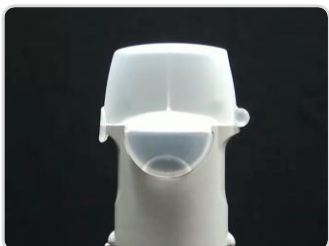
Step9: Close the inhaler.

Tip: Remember to rinse your mouth thoroughly after taking your dose and spit out the water.