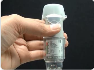
Step1: Hold the Respimat straight up.