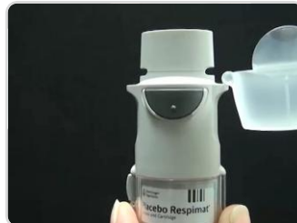
Step3: Open the cap. You'll hear a click.